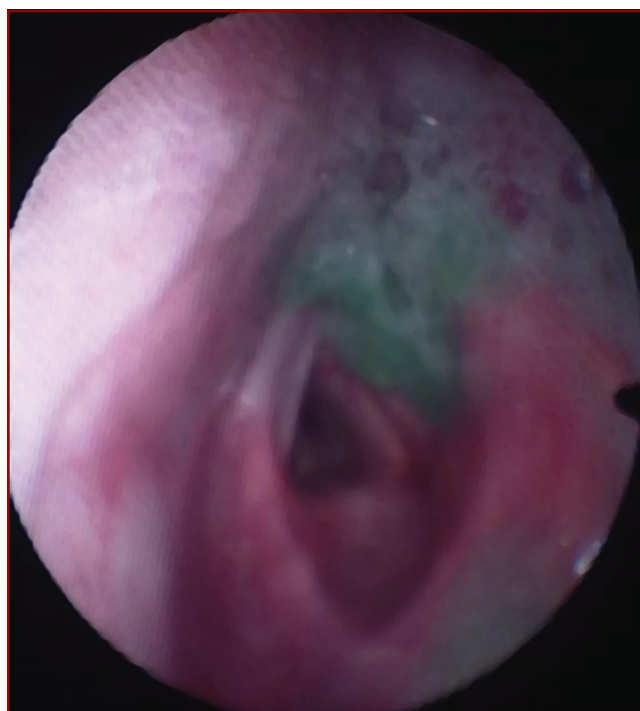
FIGURE 1–2. An example of penetration. The food remains just above the vocal folds; if not cleared with a cough, it may fall into the trachea.

Most of the evidence that exists is based on studies of stroke patients, although, as pointed out in Chapters 6, 7, and 8, there also is evidence derived from research on patients undergoing treatment for cancers of the head and neck that dysphagia treatment improves recovery. The limited evidence suggests that, in the acute care setting, dysphagia management is accompanied by reduced pneumonia rates. Furthermore, the use of a complete clinical swallow evaluation (CSE) appears to be cost